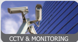
CCTV & MONITORING

Fire is a serious risk to both people and premises, and having an approved fire system in place is mandatory. A well designed system will ensure early detection of any risk anywhere, allowing people to have the maximum time to get to safety and minimising the damage to buildings and equipment.